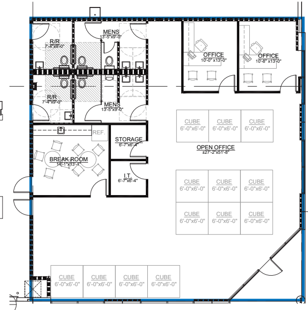
OFFICE FLOOR PLAN 1/8" = 1'-0"